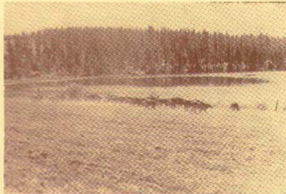
Round Up Time