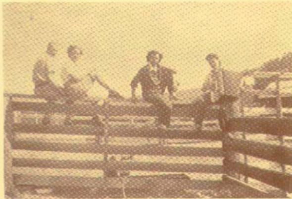
Around The Old Corral