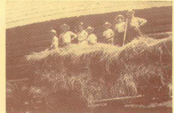
Guests on a Hay Ride

There is haying, summer fallowing, harvesting, etc., at the proper times; and many other phases of ranch life will attract your attention.