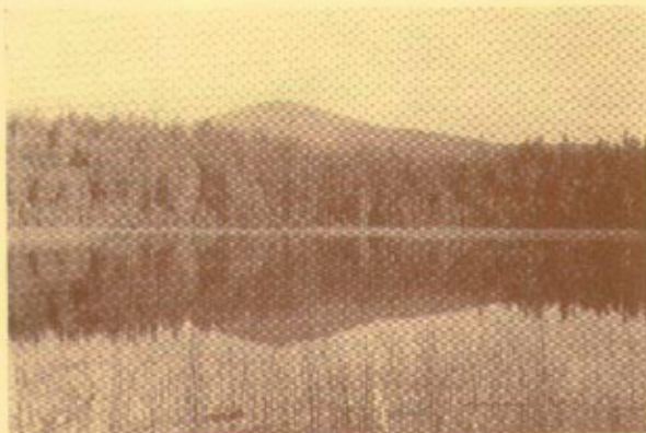
Walker Lake (On the Ranch)

The center of activity is the Lodge in which are located the dining room and lounge. Evenings around the huge stone fireplace are never-to-be-forgotten memories. Cards and dancing for those who prefer them.