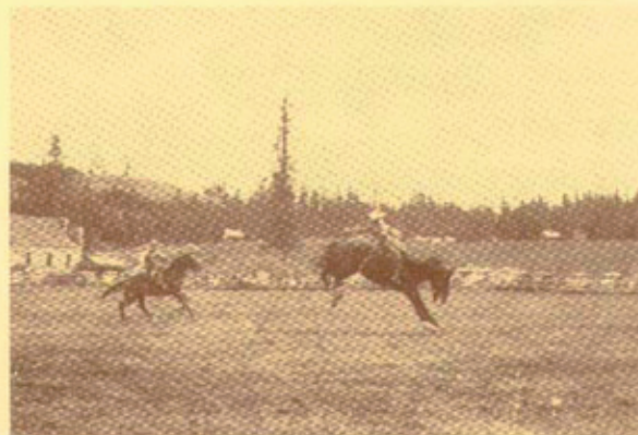
"Ride 'Em, Cowboy"

There is a 40-acre lake on the ranch and the Lodge is situated close beside it.