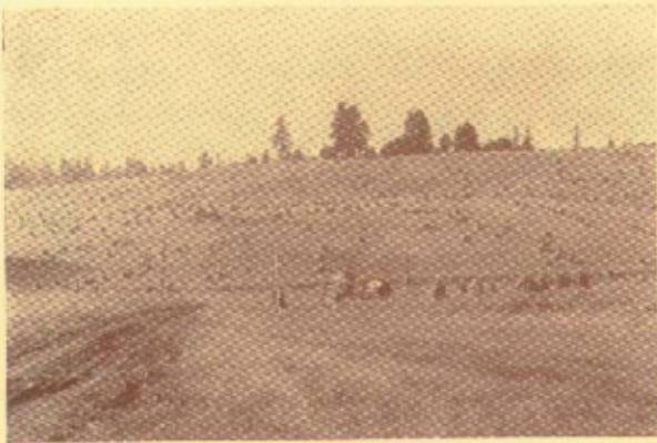
Part of Our Fields and Riding Country Beyond